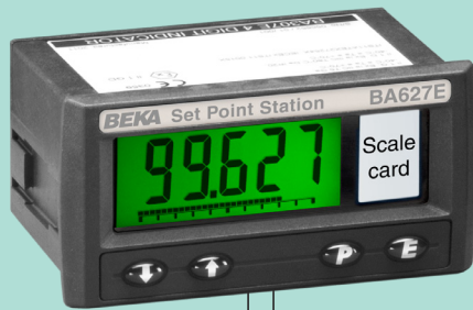
Shown with optional loop powered backlight

The BA627E is a panel mounting set point station that enables the current flowing in a 4/20mA loop to be manually adjusted via the front panel push buttons from within the process area. It is a second generation instrument that is mechanically and electrically compatible with the earlier BA505C, but has more display digits plus additional functions.