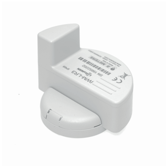
Compatible water meters