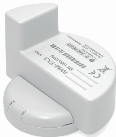
Compatible water meters