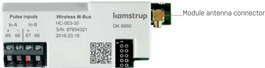
2 x pulse inputs