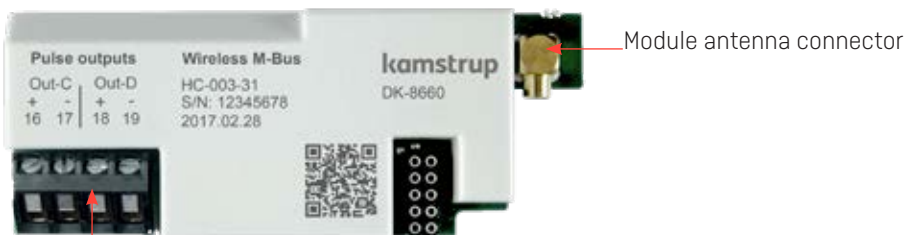
2 x pulse outputs